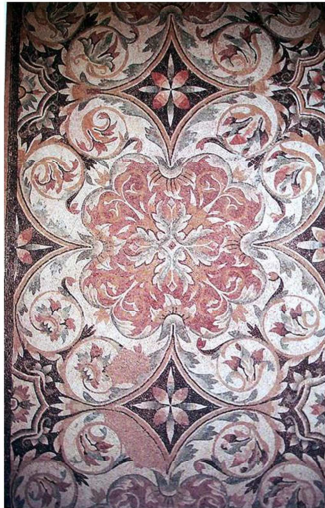
Section of a repeating mosaic floral pattern, Timgad, Algeria 3rd Century AD

Timgad, in the present day Algeria, was a Roman colonial town in North Africa founded by the Emperor Trajan around 100 CE. In general the North African mosaics have substantially more sophistication than the mosaics generally found in other roman colonies. Here, the monochroma of Rome never gained popularity and the designs were often rich and sumptuous such as this pattern, which spread over the whole pavement of the main reception room of a private residence. It provides an excellent example of the distinctive floral style of Timgad, in which shapes outlined by split acanthus fronds are filled in with various colors, specially black and red. The floral mosaics of Timgad are of particular interest as they contrast with the normal treatment of African floral mosaics in which the patterns are merely in outline on a white background.